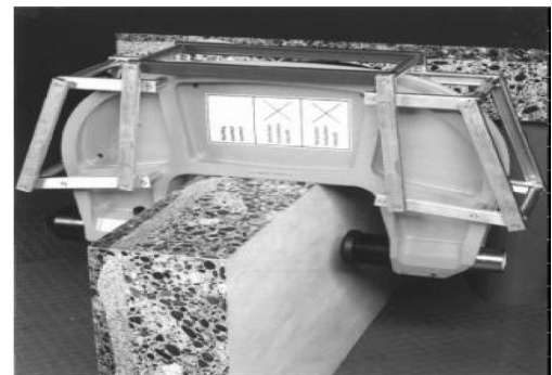
Crusher type BZ